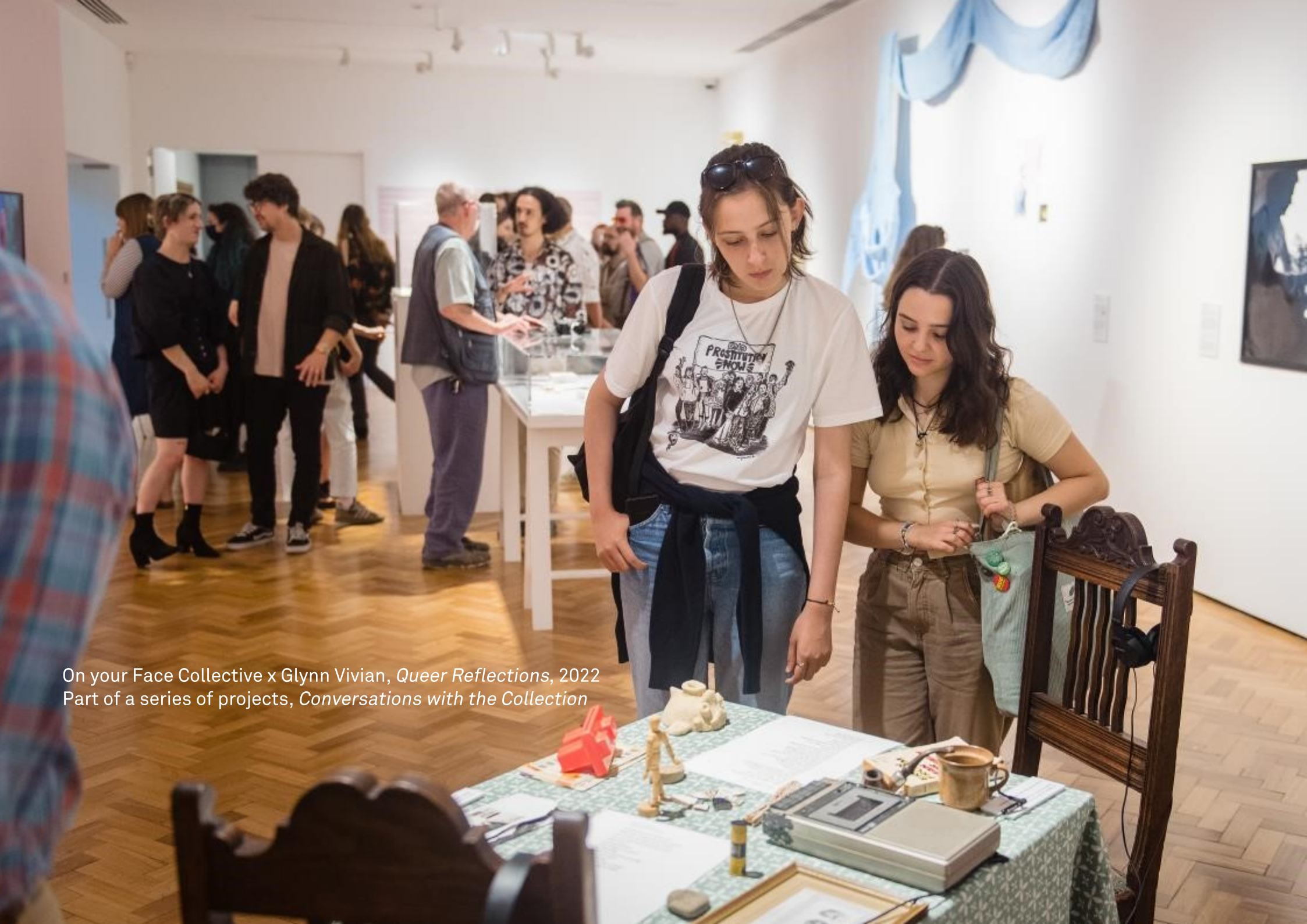
On your Face Collective x Glynn Vivian, Queer Reflections , 2022 Part of a series of projects, Conversations with the Collection