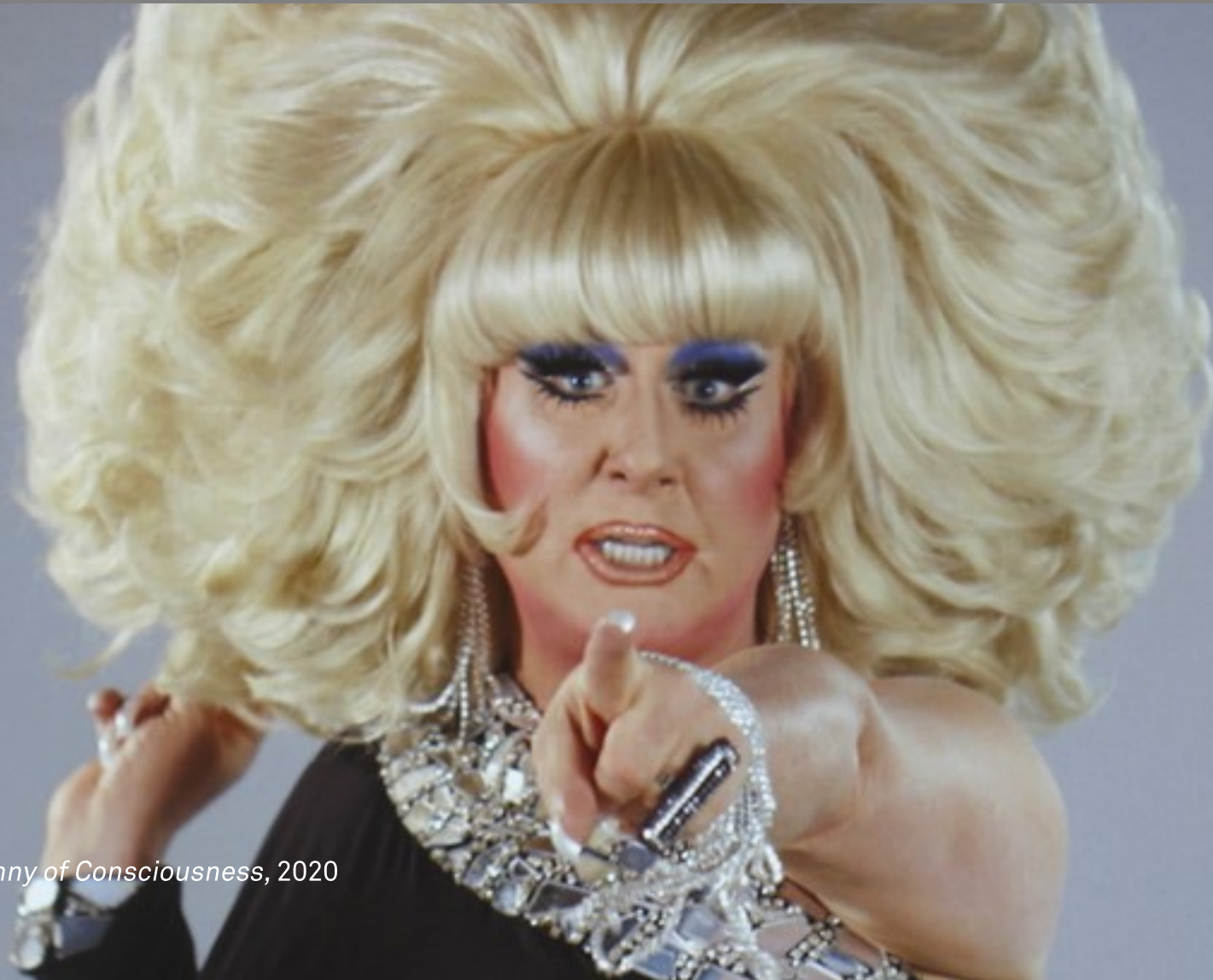
Charles Atlas, The Tyranny of Consciousness , 2020