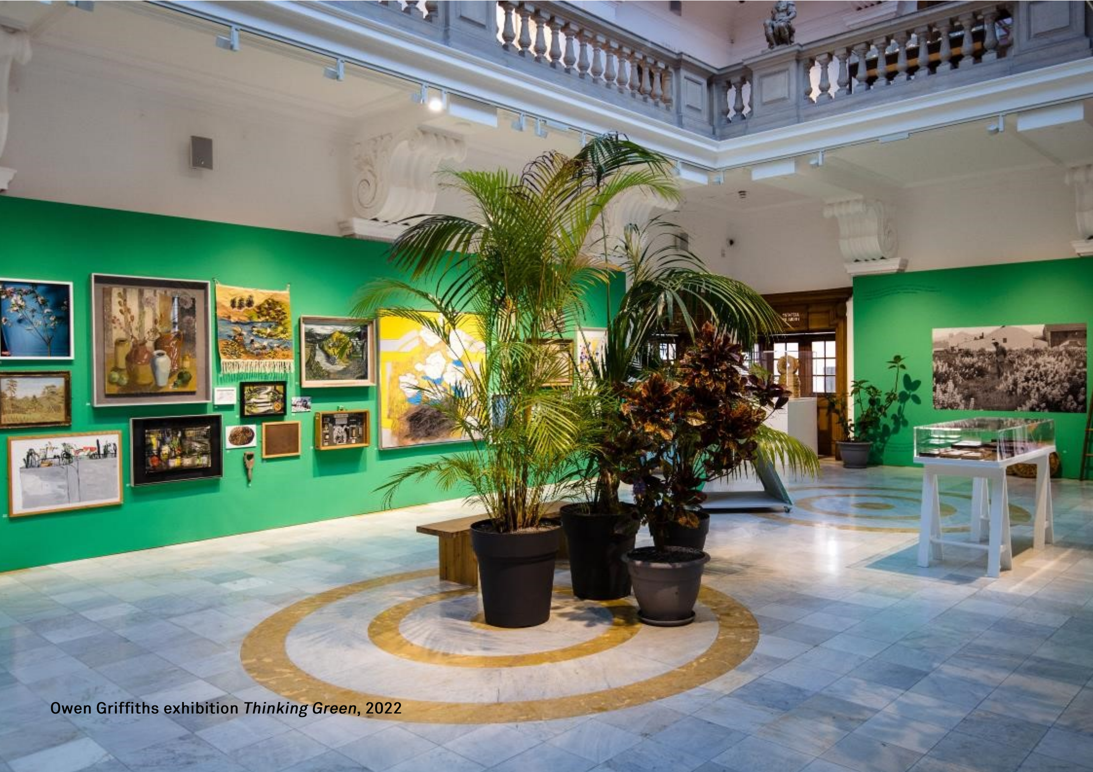
Owen Griffiths exhibition Thinking Green , 2022