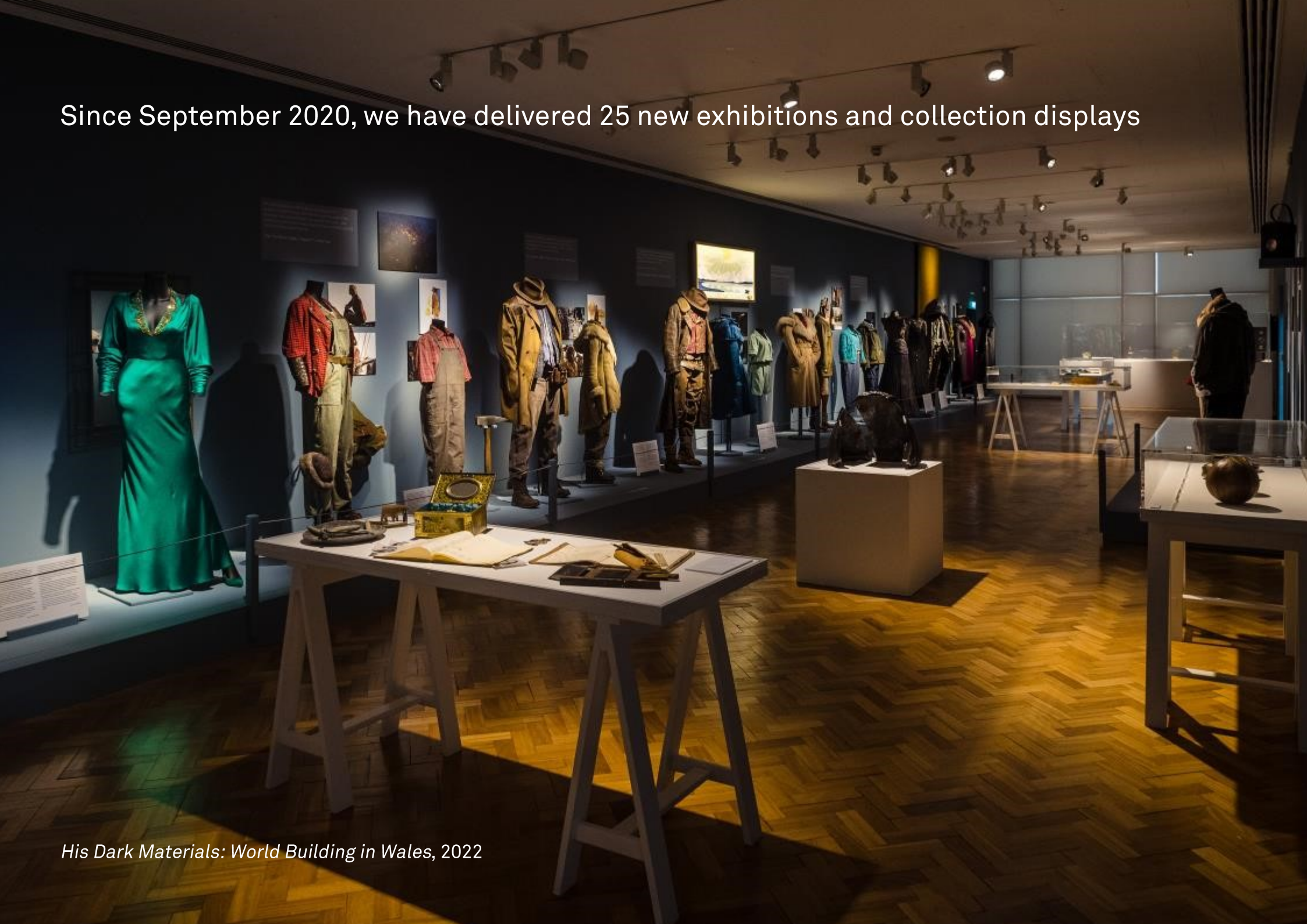
His Dark Materials: World Building in Wales, 2022

Since September 2020, we have delivered 25 new exhibitions and collection displays