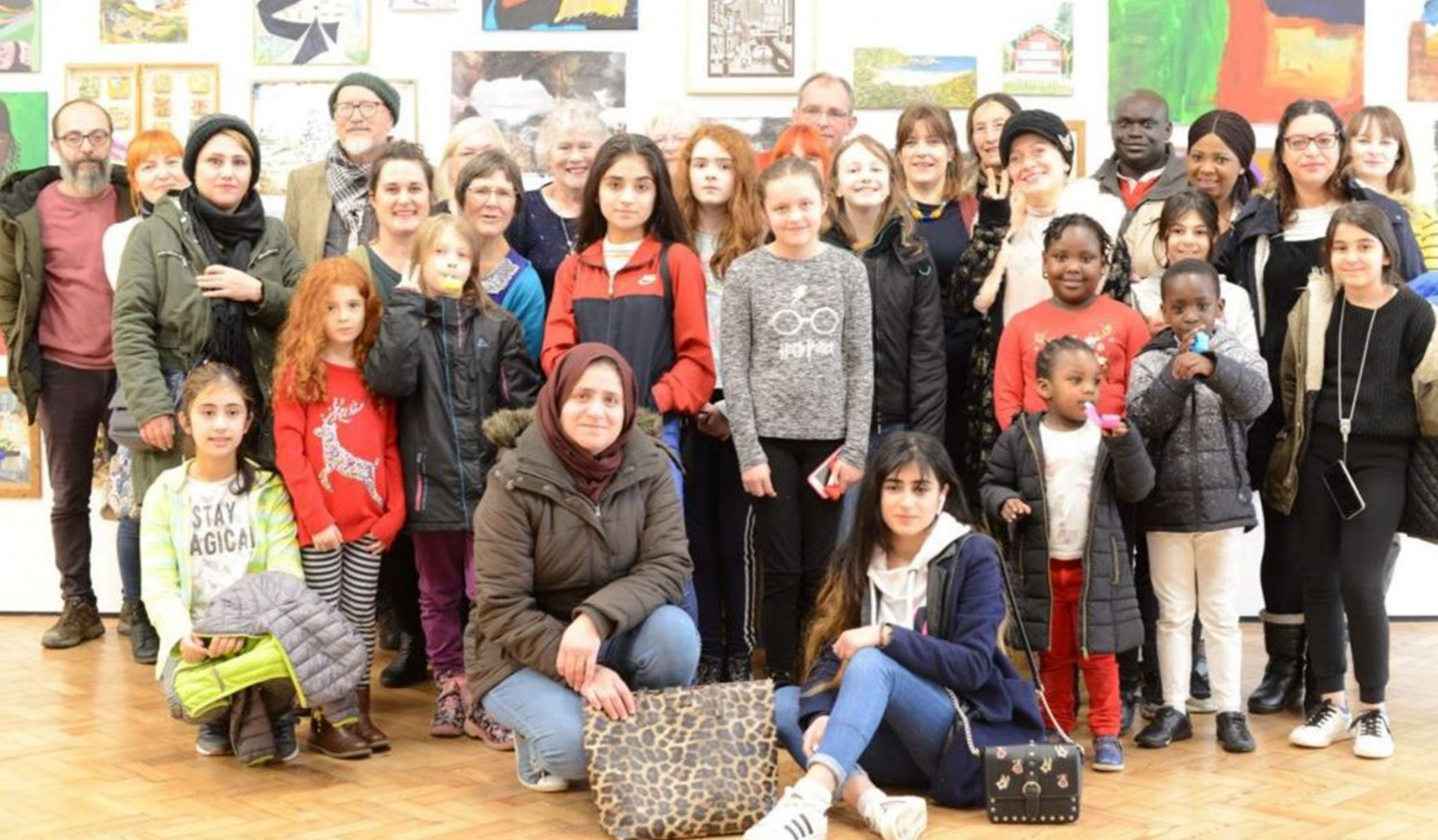
'Welcome' community group celebrating the first 'UK Art Gallery of Sanctuary'