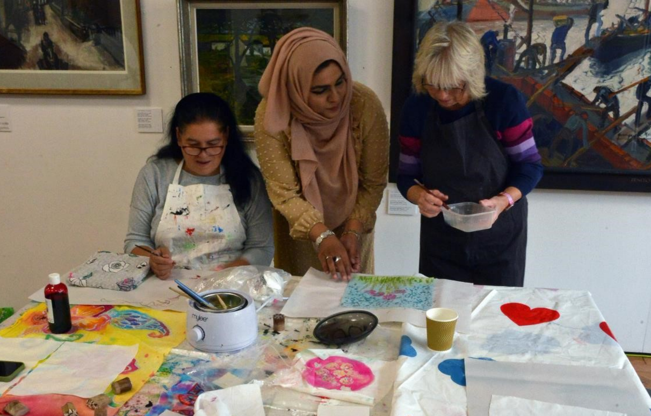
New targeted programmes to widen engagement, Threads group