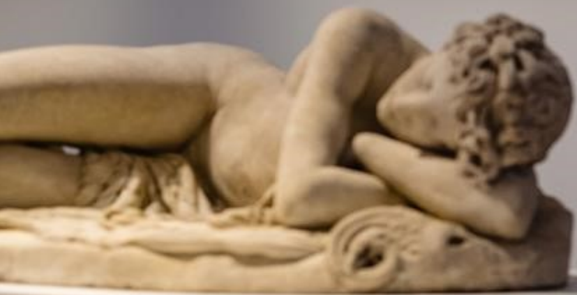
Dafydd Williams, malum , 2020