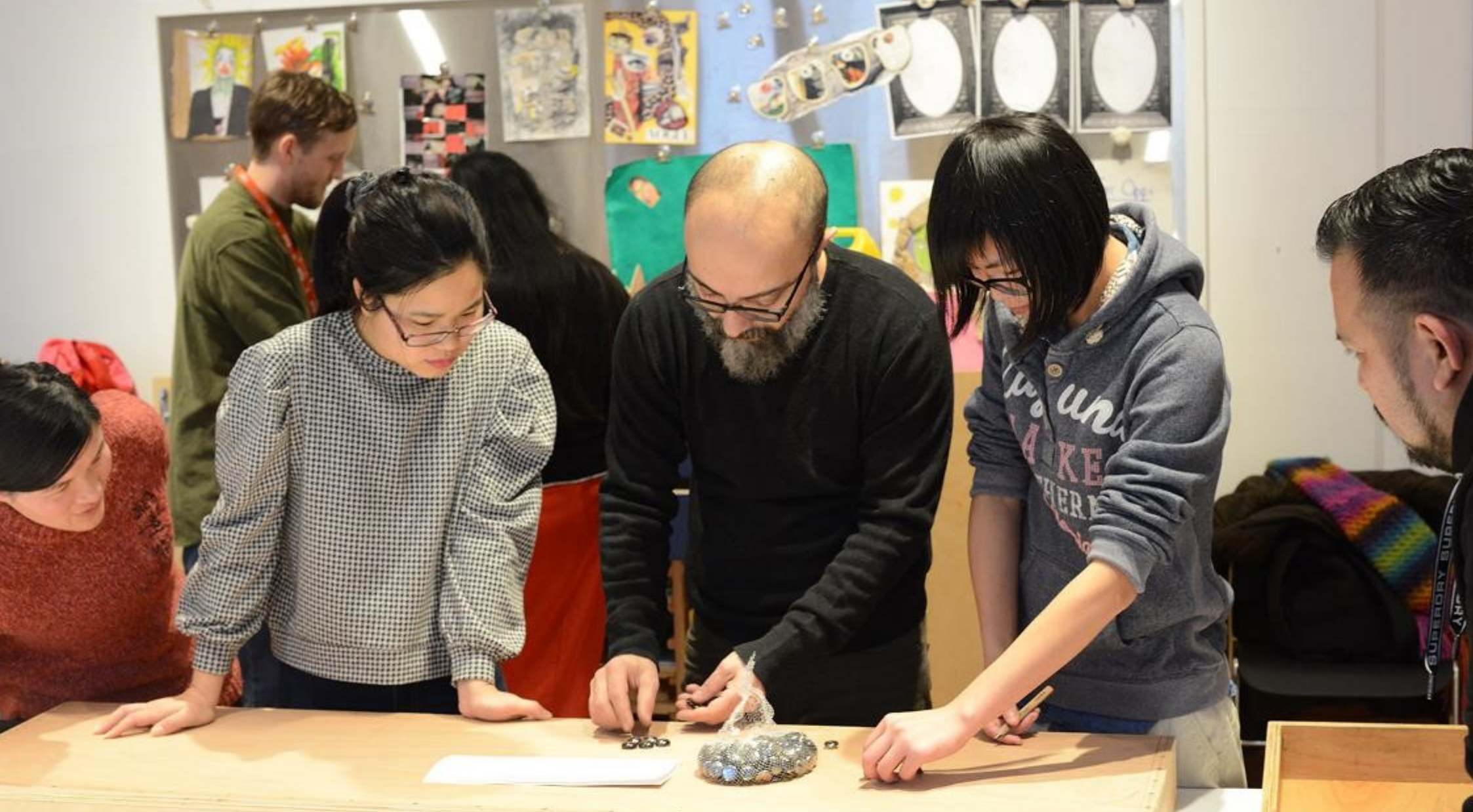
Welcome group working on mosaic benches for the gallery