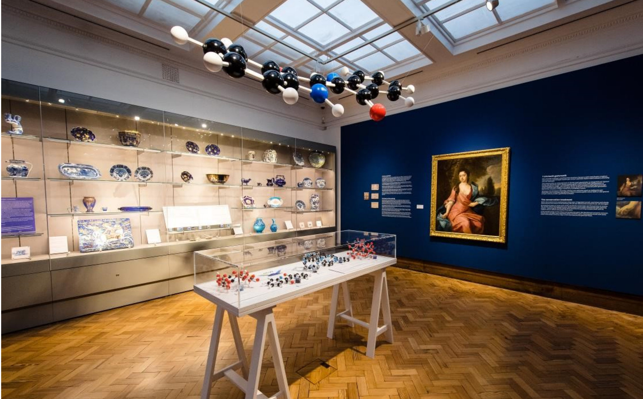
39 oil paintings conserved in our state of the art dedicated painting conservation studio Indigo: Chemistry Collections Conservation, 2021