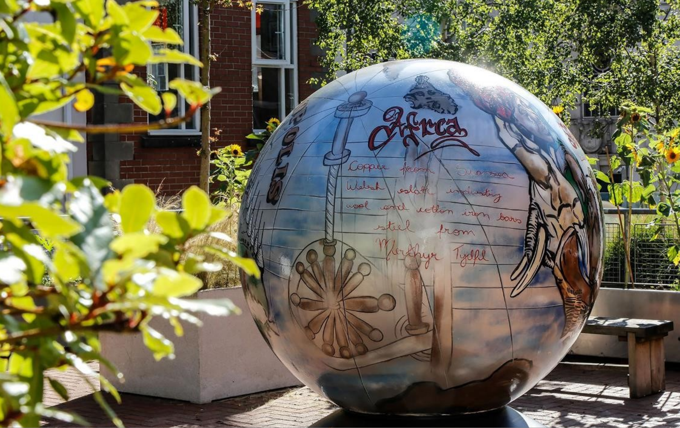
Kyle Legall for The World Reimagined Globe trail ; a ground-breaking, UK-wide art education project, to transform how we understand the Transatlantic Trade in Enslaved Africans and its impact.