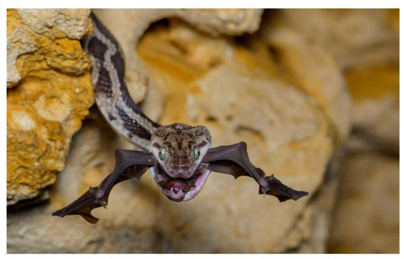
Get up close and personal with the animal kingdom at the Wildlife Photographer of the Year competition