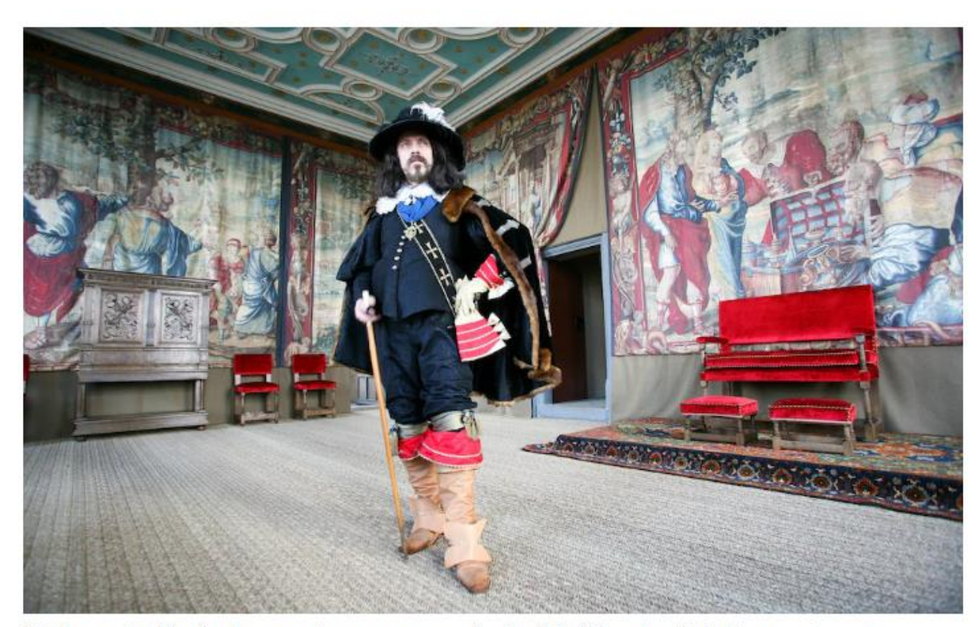
Watch a swashbuckling theatre group or try on armour as you imagine life in 14th-century England