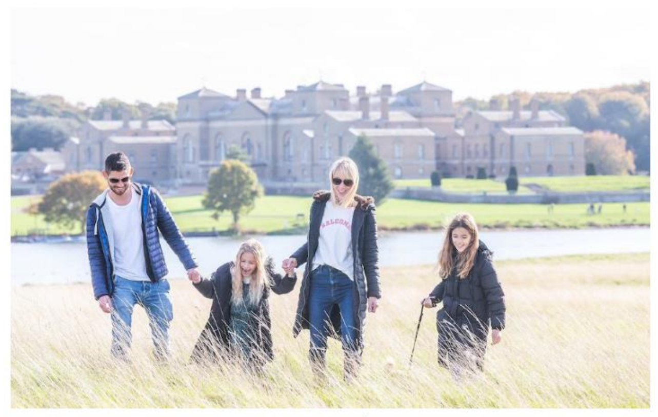
Get some fresh air while immersing yourself in stories at Holkham Park

Bookworms can get some fresh air while immersing themselves in stories at Holkham Park. A trail around the park reveals the tales behind its landmarks, while in the main house, children can make a bookmark, design the cover for their autobiography and add a line to Holkham's "never-ending story". Outdoors, there is also a nature trail around the lake and an adventure playground.