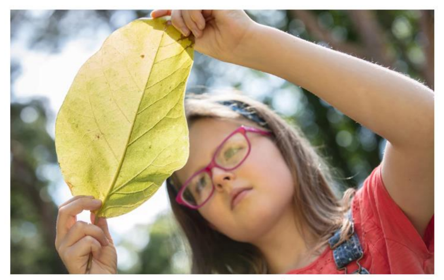
Nature study: make wilderness-inspired sketches with charcoal fresh from the kiln

The National Arboretum at Westonbirt has its own kiln for making charcoal. Visiting families (with children aged five and above) can watch it in action before picking up their pieces of charcoal for a drawing workshop. Leaves from Westonbirt's trees can be studied to sketch or create shadow pictures.