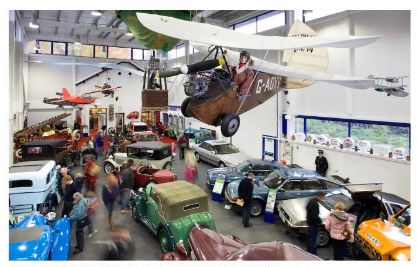
There are more than 140 classic cars and motorbikes to examine at this former mill