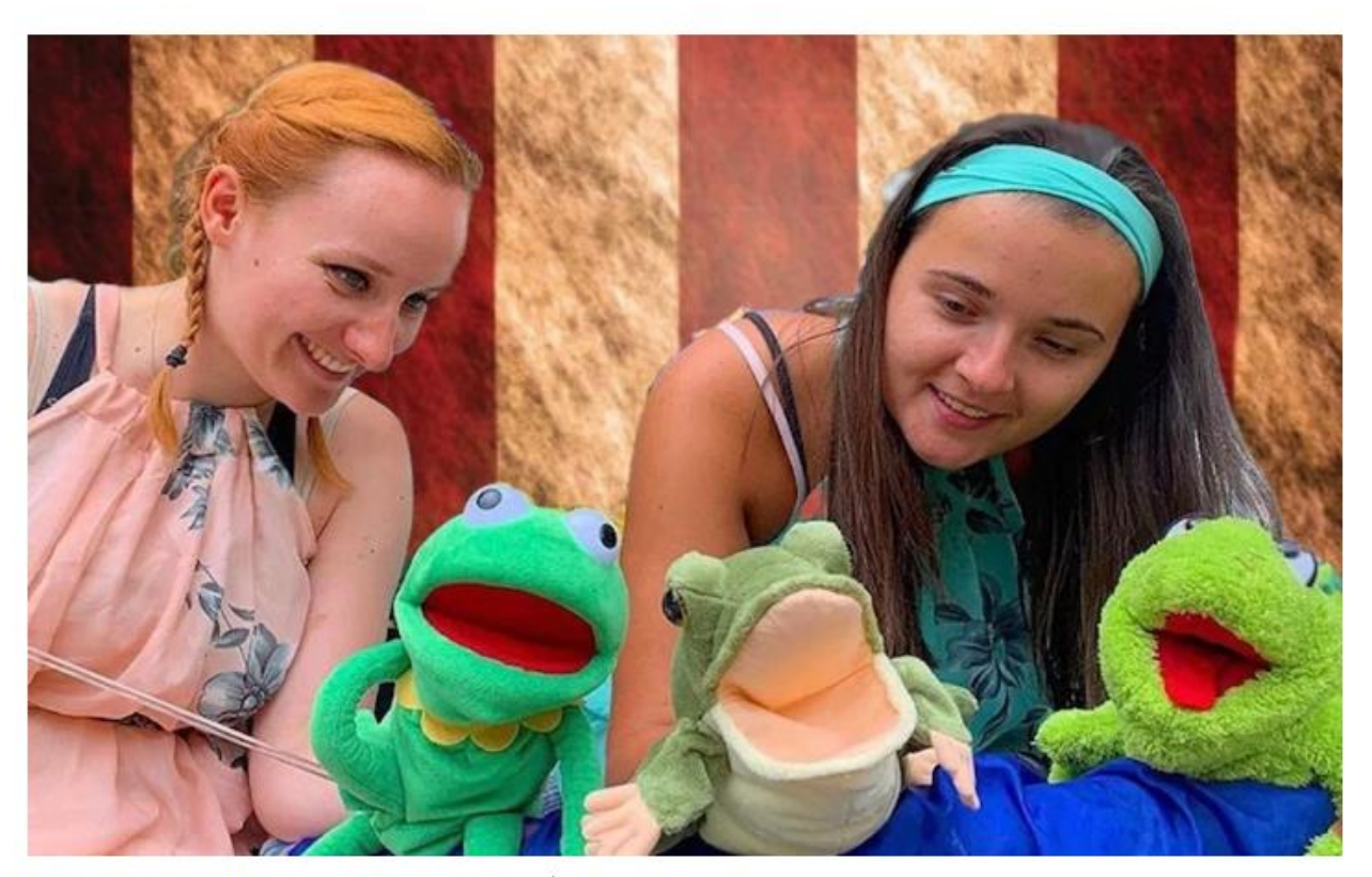
This live performance promises a wacky adventure

With an old trumpet and a single boot, Quentin Blake's delightful creation is the subject of a show put on by visiting group Folksy Theatre at Bath's Mission Theatre. Taking younger children on a wacky adventure, the performance features live music, puppetry and bags of audience interaction.