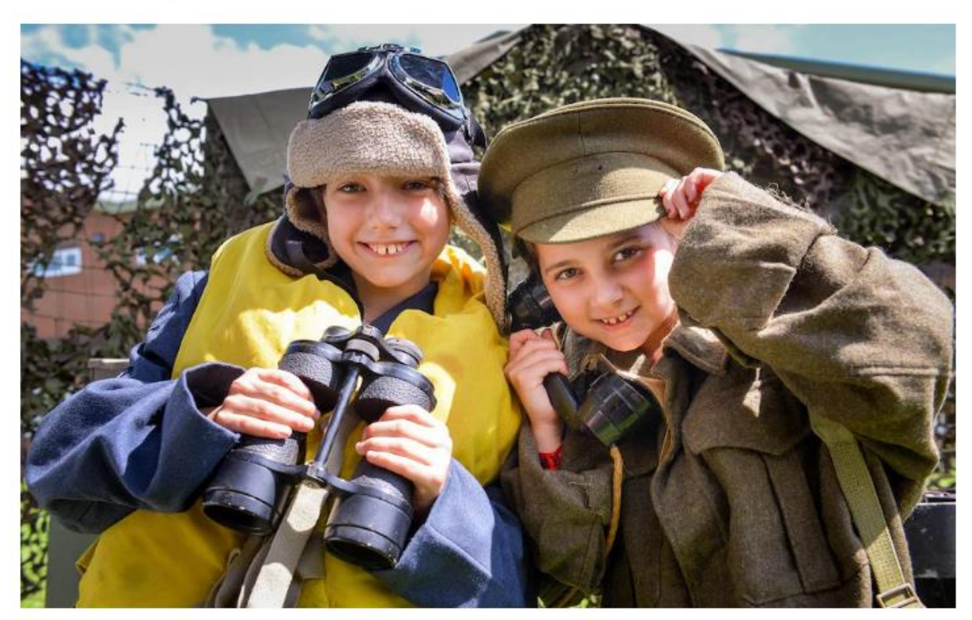
Explore life in the sky at the RAF Museum in Cosford

Bright young minds get airborne at the RAF Museum Midlands in Cosford, where a range of challenges have been devised to keep children busy. These could involve modifying a mini quadcopter drone so that it can track polar bears, launching rockets or using coding to guide a sphere through a maze. Regular exhibits tell the story of the RAF and the museum has a fine collection of aircraft, including Spitfires and Valiants, too.