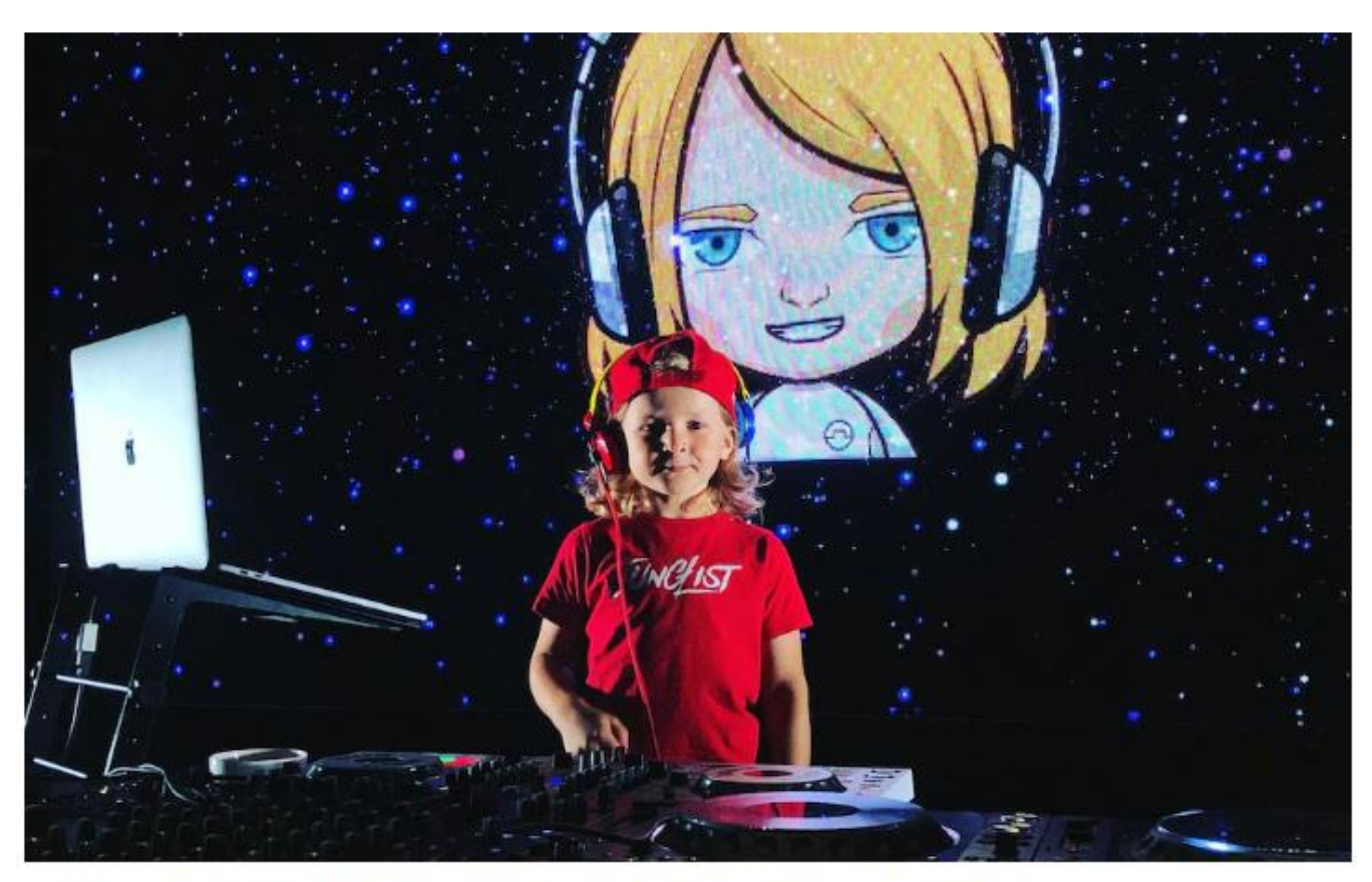
Spark imaginations and unleash creativity with a host of captivating performances and activities