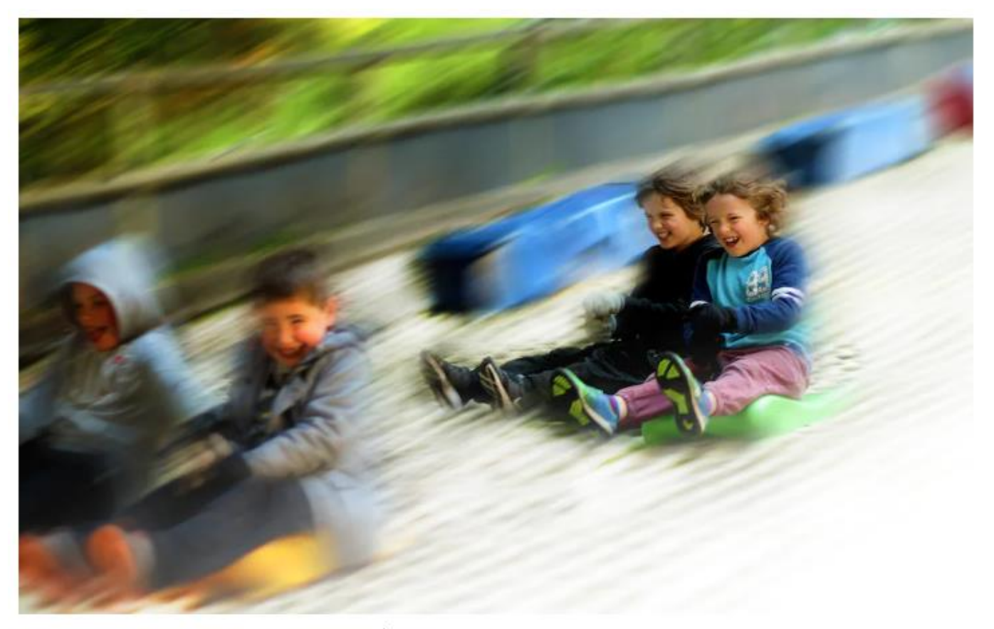
Catch some speed at the Mendip Activity Centre

The Mendip Hills are known for their gorges and caves, but snowsports? It's been frosty enough lately to go sledging, but it's easier to take kids to the dry ski slope at the Mendip Activity Centre. While adults watch, children between four and 12 years old can grab toboggan seats that have steering sticks for a half-an-hour session on a wooded slope.