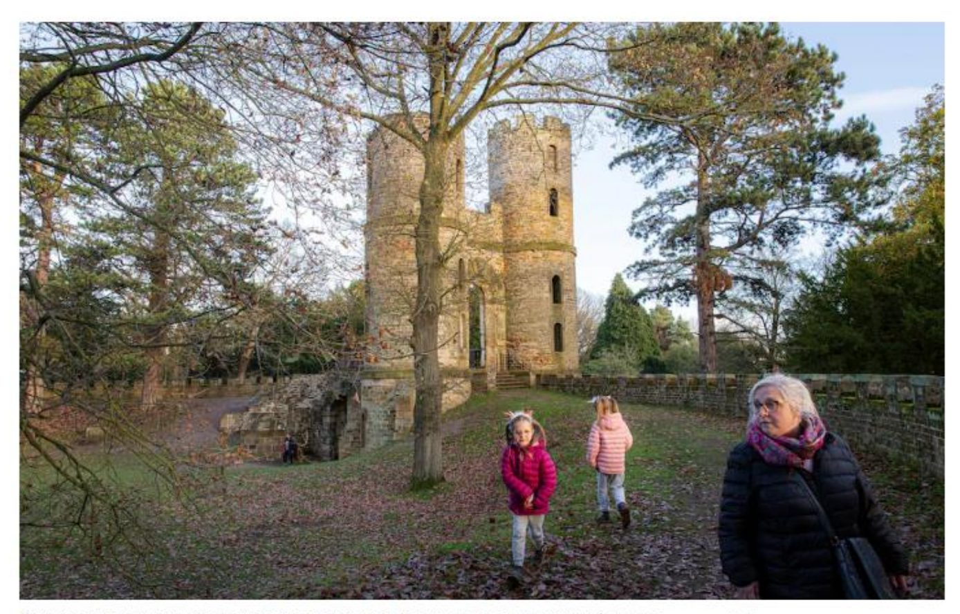
Draw inspiration from patterns in nature before crafting your own beeswax wrap

Beeswax wraps are a great reusable alternative to clingfilm and families can make their own at the National Trust's Wentworth Castle Garden. There is time to be inspired by patterns in nature first, on a wander around the Victorian conservatory and Grade I-listed gardens. Then, in the Blackbourn Room, design a fabric square to turn into a wrap to take home. There is a zipline and an adventure playground outside too.