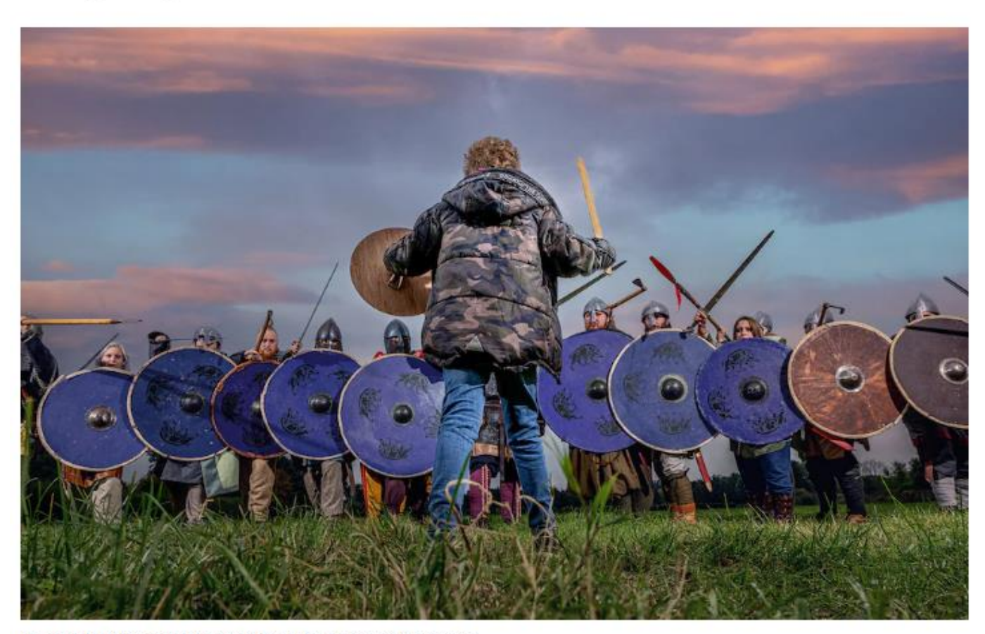
Marauders approaching: visit York for the Jorvik Viking Festival

Marauders can be found on York's streets for the annual Jorvik Viking Festival. Expect lots to see for free across the city, from best beard competitions to storytelling and mock combat at St Helen's Square, plus Vikings to meet at their encampment on Parliament Street. Brooch, shield and pottery crafting sessions take place in the Guildhall, for \pounds 3 a go, where there is also a battle training bootcamp for \pounds 5 .