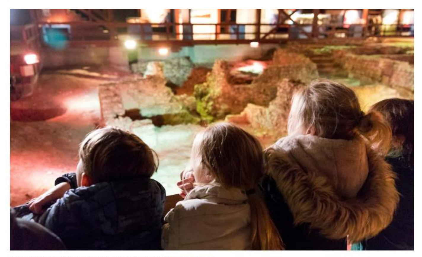
Completely undercover, the villa is perfect for rainy February days

Lullingstone Roman Villa is one of Britain's most remarkably intact villas and it is completely undercover, so perfect for rainy February days. The stones date back to AD100 and the villa was probably at its most magnificent during the 4th century. A light show will keep children's attention and there is plenty to see, from mosaics to rare wall paintings, various artefacts, a heated bath suite and a chapel.