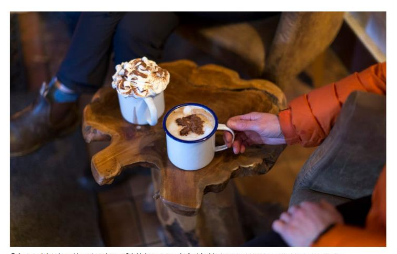
Enjoy a pub lunch and hot chocolate at Sticklebarn tavern in Ambleside