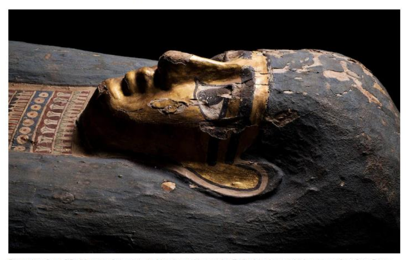
Reopening after a £15 million transformation, the Manchester Museum is offering brand new exhibits with artefacts from Egypt and Sudan

At more than 130 years old, the Manchester Museum is reopening after a £15 million transformation. Taking pride of place in the brand-new exhibition hall are exhibits from Egypt and Sudan that include more than 100 objects and eight mummies. Learning is made easier for children via replica objects that, when touched, bring up information on digital displays. In the dinosaur gallery there is the newly acquired April the Tenontosaurus.