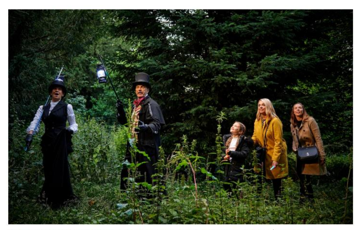
Dress up and join in with interactive storytelling and games at this 1860s English Heritage property

Kids who enjoy dressing up can be a Victorian for the day at Brodsworth Hall. The 1860s English Heritage property will have would-be residents in Victorian attire walking the corridors, encouraging families to join in with interactive storytelling or games. Don't miss the pleasure gardens too, which have been fully restored and are listed, with a fern dell grotto and a gentrified garden loo.