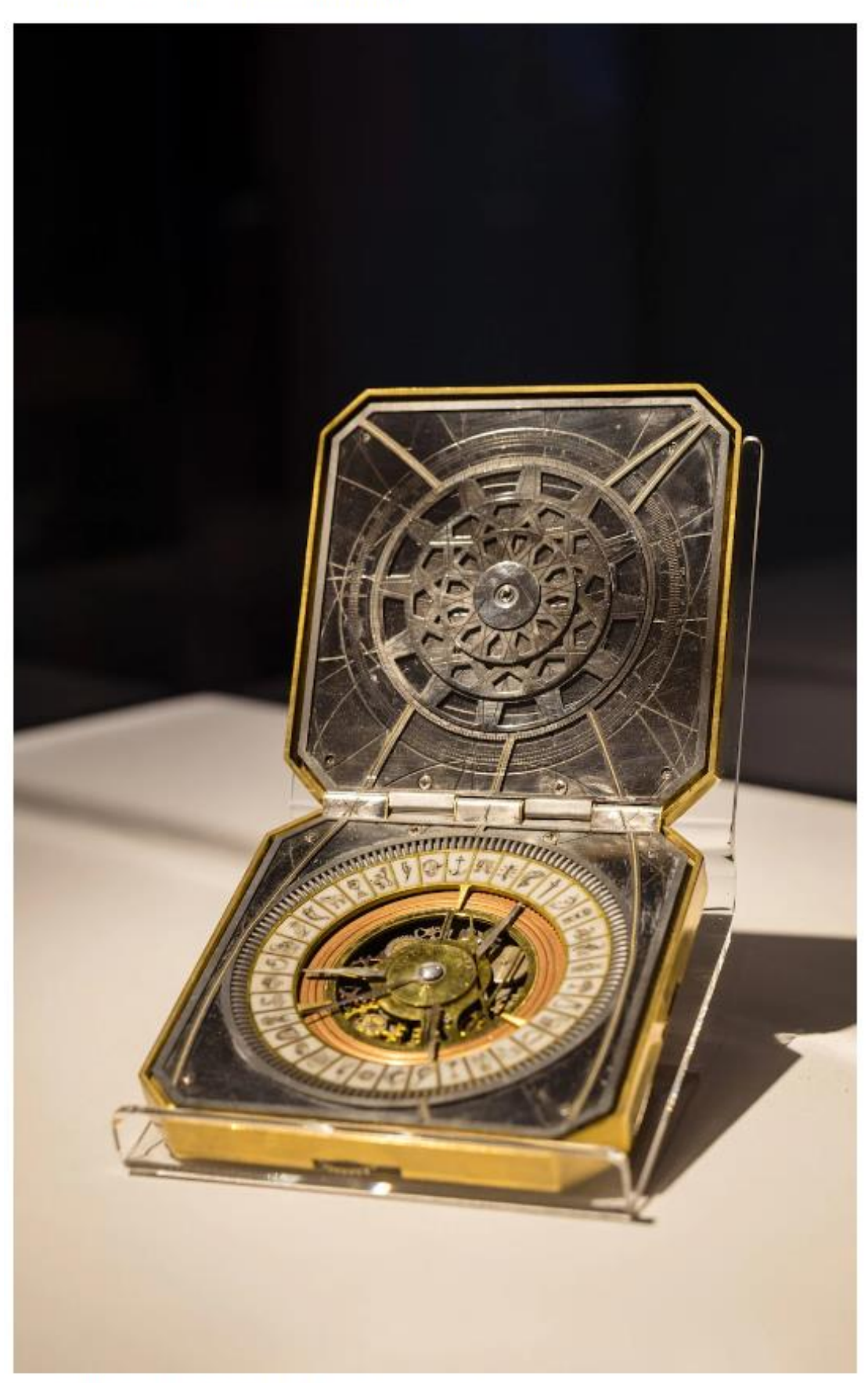
View the alethiometer at Glynn Vivian Art Gallery