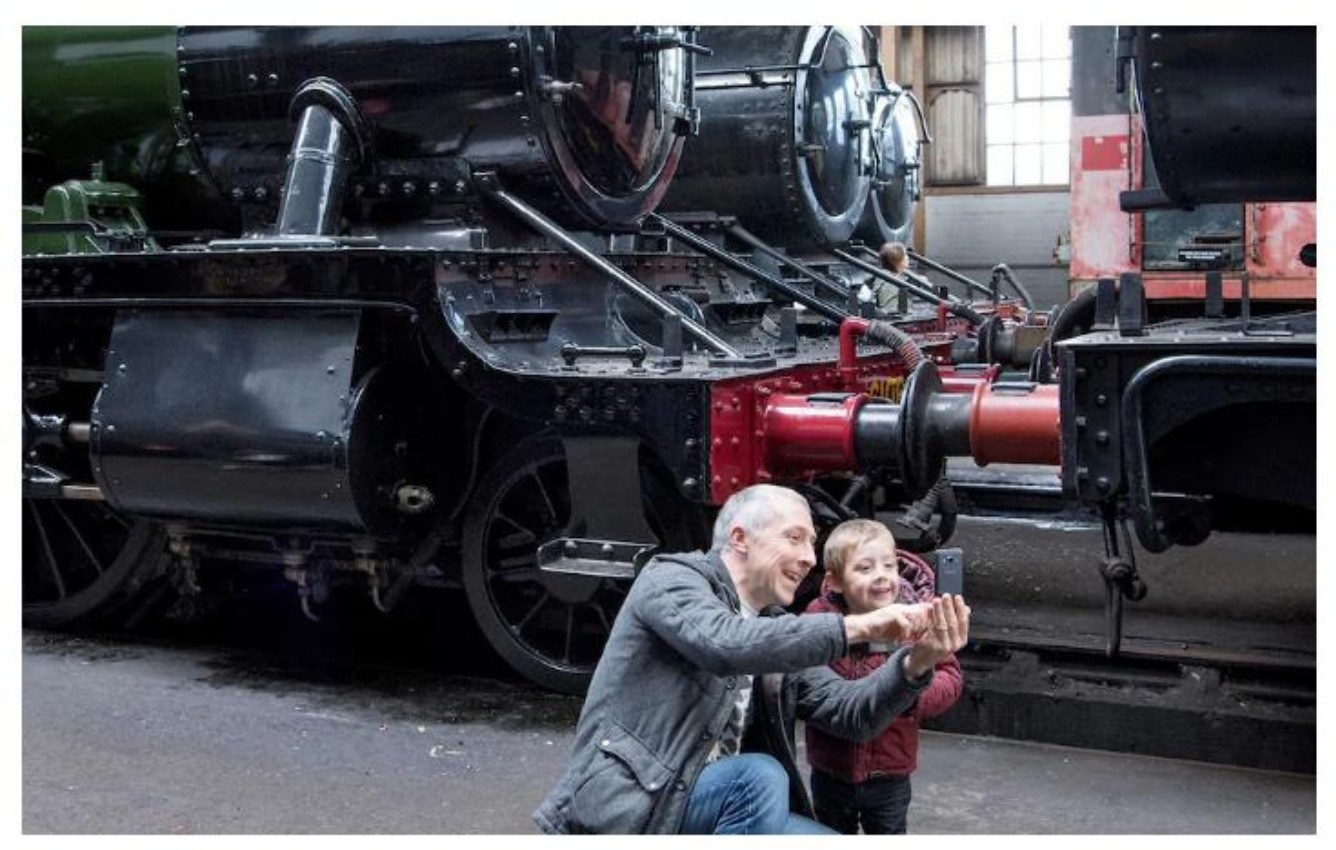
Experience hands-on and immersive play at Didcot Railway Centre

Train-mad children can touch and climb on to vintage engines while they are stationary during Discovery Days at the Didcot Railway Centre. In an engine shed built in 1932, a number of locomotives have been preserved, including the splendid green Hall class steam locomotive Hinderton Hall. Didcot's signalling centre is set up for hands-on play, while there is also an air- raid shelter to experience.